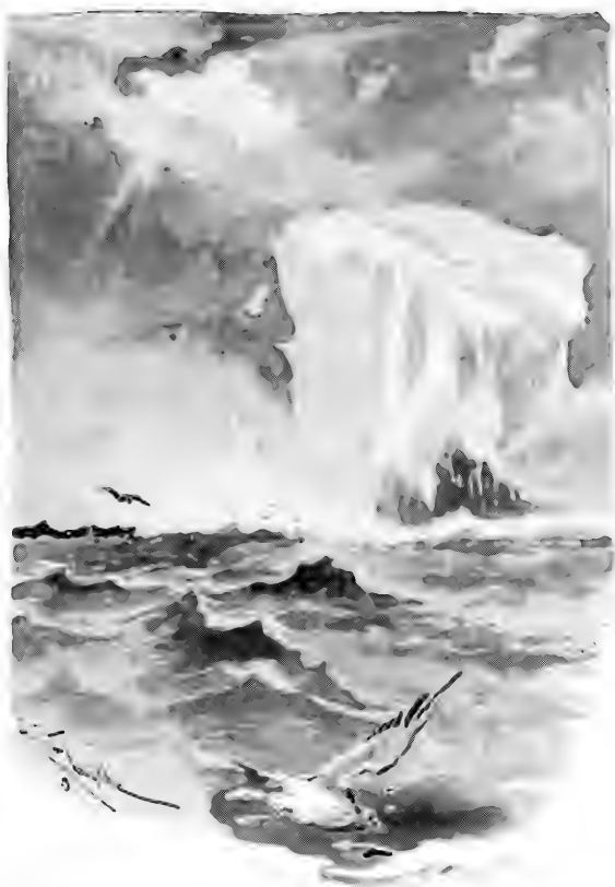
"THE LOOSENED ICE-RIDGE BREAKS AWAY. —Page 136.